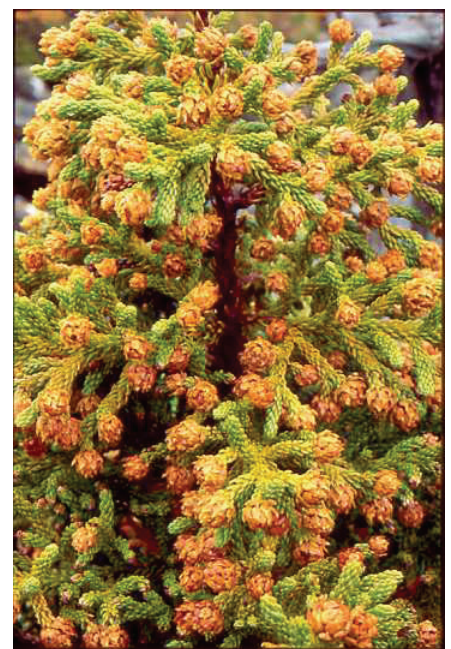
Athrotaxis selaginoides - King Billy Pine