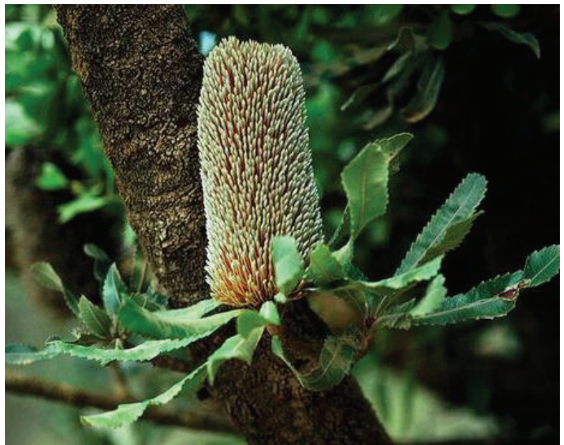
Banksia serrata - Saw Toothed Banksia