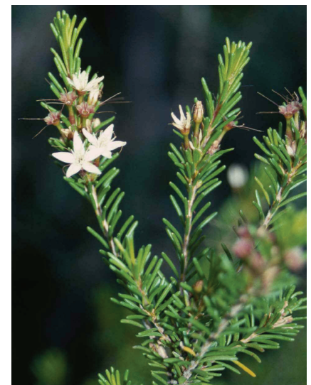
Calytrix tetragona - Fringe Myrtle