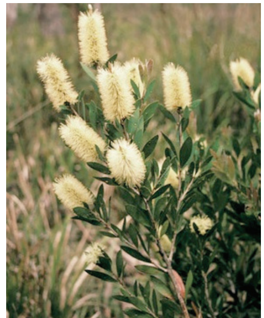
Callistemon pallidus - Lemon Bottlebrush