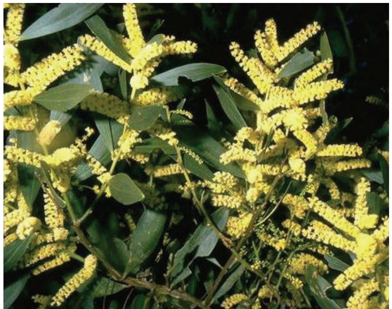
Acacia sophorae—Coastal Wattle